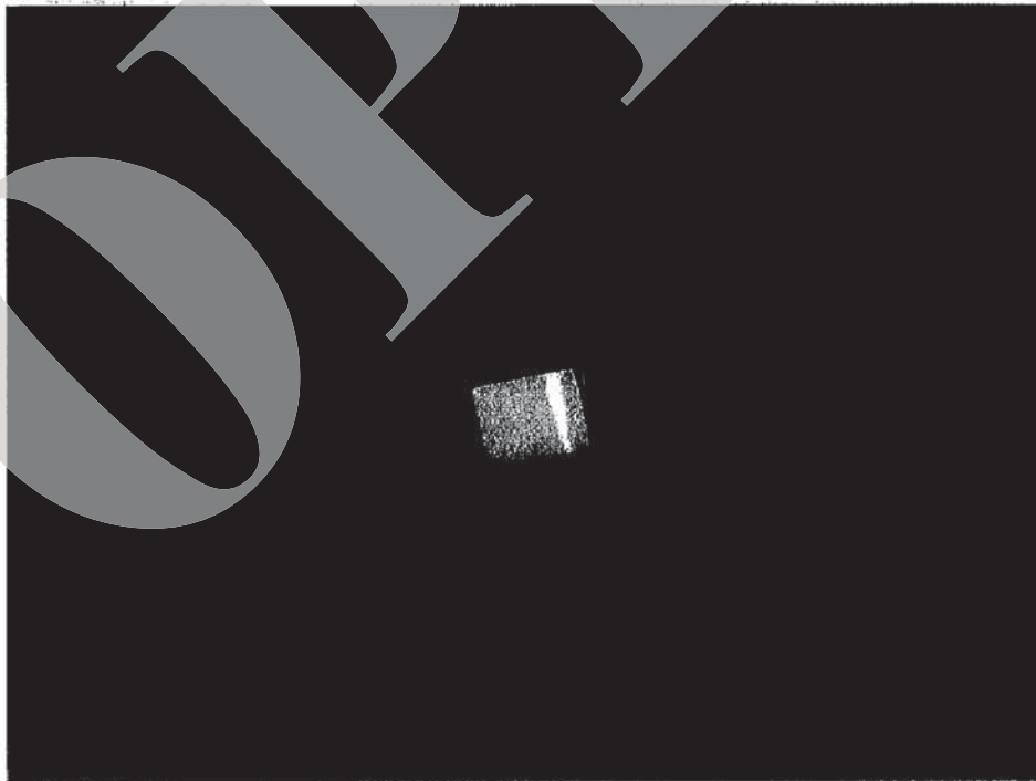
Photo 48 – Piping feature/sand boil (about 1 foot deep, 3.5 feet in diameter) in the Missile Shield Room on the south side of the Auxiliary Building.