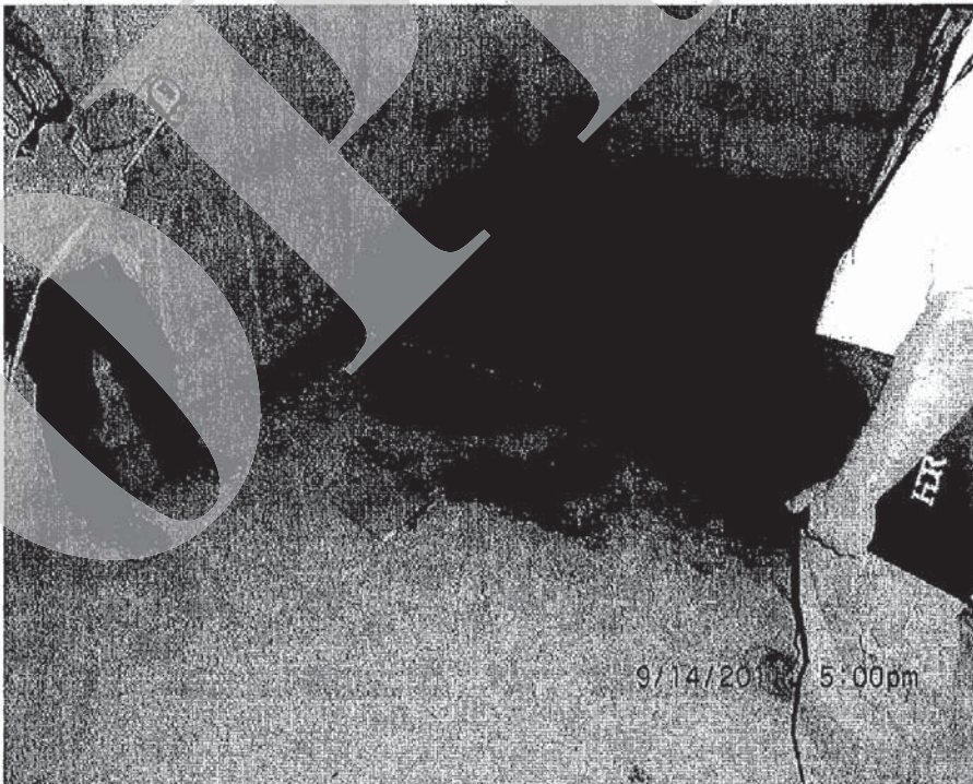
Photo 50 - Piping feature/sand boil (about 1 foot deep, 3.5 feet in diameter) in the Missile Shield Room on the south side of the Auxiliary Building.