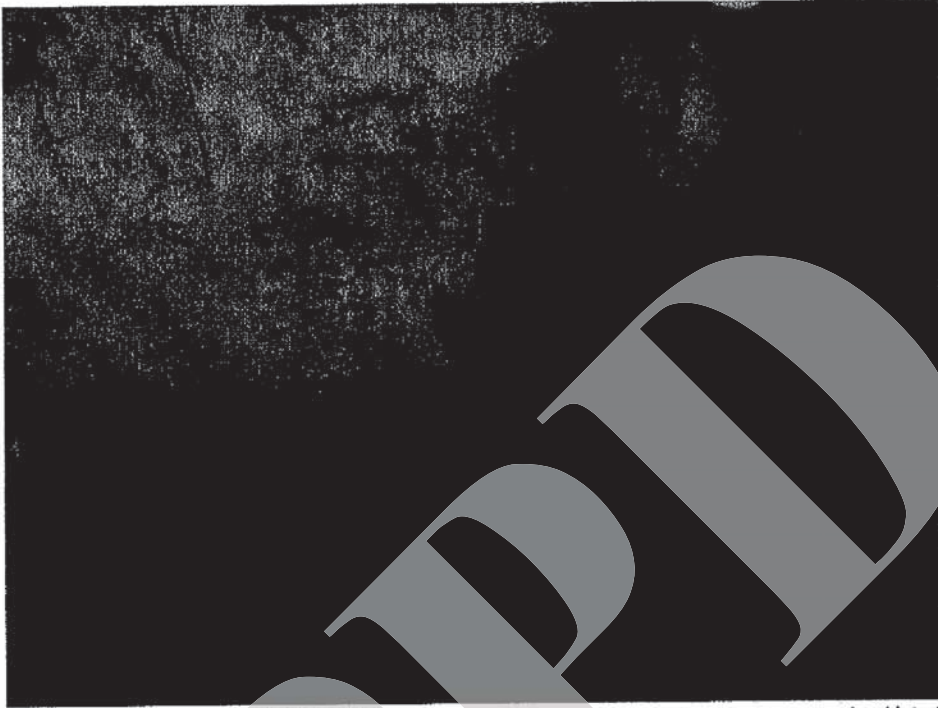
Photo 51 – High water mark on Missile Shield Room wall indicating about 9 inches of water was piped into the room.