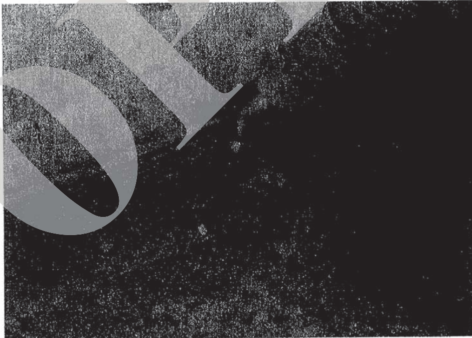
Photo 52 – Thin (about 1/16-inch thick) layer of sediment apparently piped into the room.